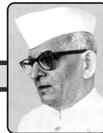
Founder Kulapati Dr. K.M. Munshi

BHARATIYA VIDYA BHAVAN (Founded in 1938 with the blessings of Mahatma Gandhi) Munshi sadan, BVB Chowk, Kulapati K.M.Munshi Marg, Mumbai-400 007